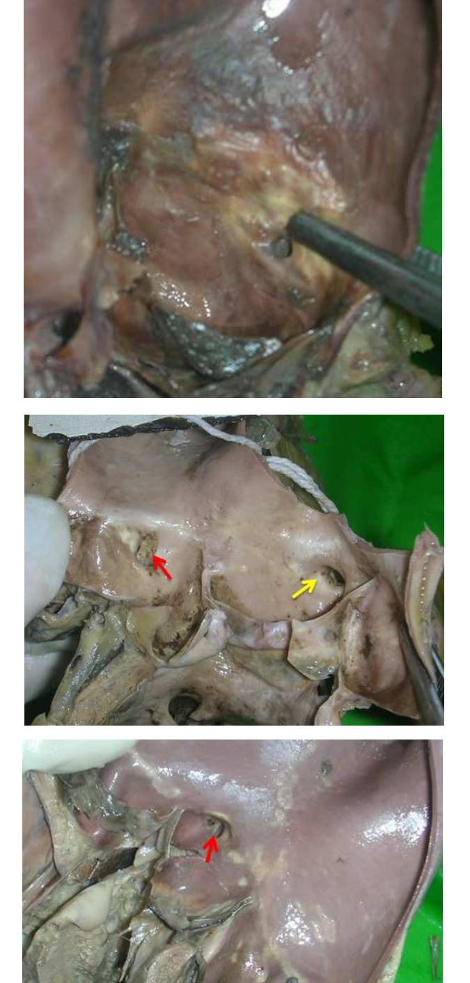
Fig. 3 (top). Right coronary ostium in the right sinus, circular in shape, sinotubular location, eccentric in position.

Fig. 4 (middle). Yellow arrow pointing towards right coronary ostium in the right sinus, horizontally oval in shape, tubular location, close to the right side of the commissure. Red arrow pointing towards the left coronary ostium in the left sinus, sinotubular central location, horizontally oval in shape.