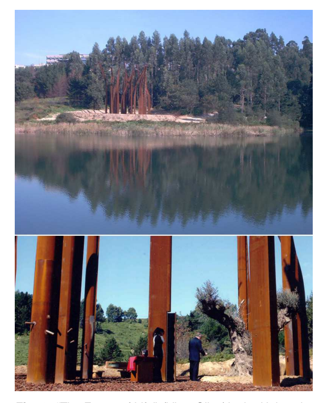
Fig. 3. "The Forest of Life" ( Vitae Silva ) in the University of the Basque Country (UPV/EHU) campus at Leioa, near Bilbao (Spain). When you arrive to Bilbao by airplane you are able to see this monument in the University campus on top of the hill. During a ceremony, the urns are deposited in the reserved space within the wooden pillars that form the Forest of Life.

How can donors be thanked? There are many different ways in which appreciation can be expressed to donors and their families, depending on local traditions, how the donation programs have evolved over the years or on religion and customs to celebrate death. In many European countries such ceremonies have already existed for a long time. The most common sign of appreciation is a thank-you letter to the families. Another possibility is a commemoration ceremony; this may be combined with the presence of medical students. For example, in Basel (Switzerland), medical students have formed a choir and they sing for the families during a ceremony where thanks are expressed for donations. At The University of the Basque Coun-