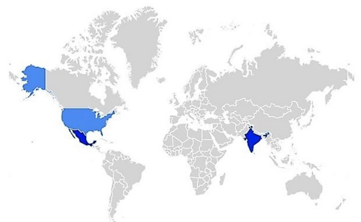
Fig 1. Keywords-Based Geographic Mapping.

+ Retrospective Mapping via Google Trends [2004-current] [Time-stamp: September 1st, 2019].