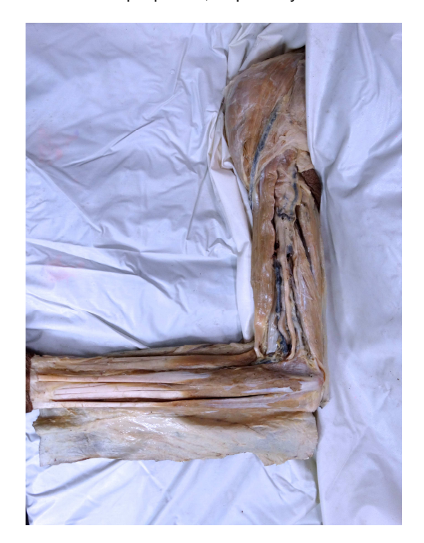
Fig. 1. Dissected specimen of superior extremity of a cadaver preserved in 1% Phenoxetol for more than six months showing the colors of muscle, nerves and vessels.

For dissection purposes we found the preservation in 1% Phenoxetol very satisfactory. Much of the rigidity of the tissues caused by the initial aldehyde fixation disappears after some weeks in Phenoxetol and all tissues gain a flexible, partly elastic, consistency not unlike the consistency of fresh unfixed tissue, and well suited for dissection and demonstration purposes, especially for demonstra-