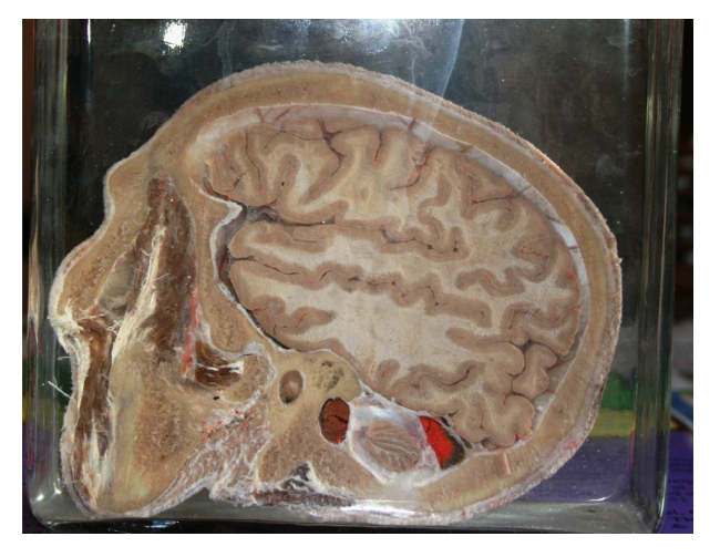
Fig. 2. Museum specimen of head preserved in 1% Phenoxetol for more than one year.

tion of movements across joints. We are of the opinion that 1% Phenoxetol enhances lifelike tissue colors (Fig. 1) rather than disturbing them. Detachment of epidermal layer of skin in some areas was noted, as is common with other methods of preservation.