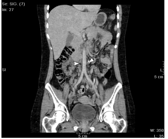
Fig. 1. A coronal CT reconstruction of the abdomen and pelvis shows the aorta (arrows) with absence of the inferior vena cava and development of the lumbar veins.