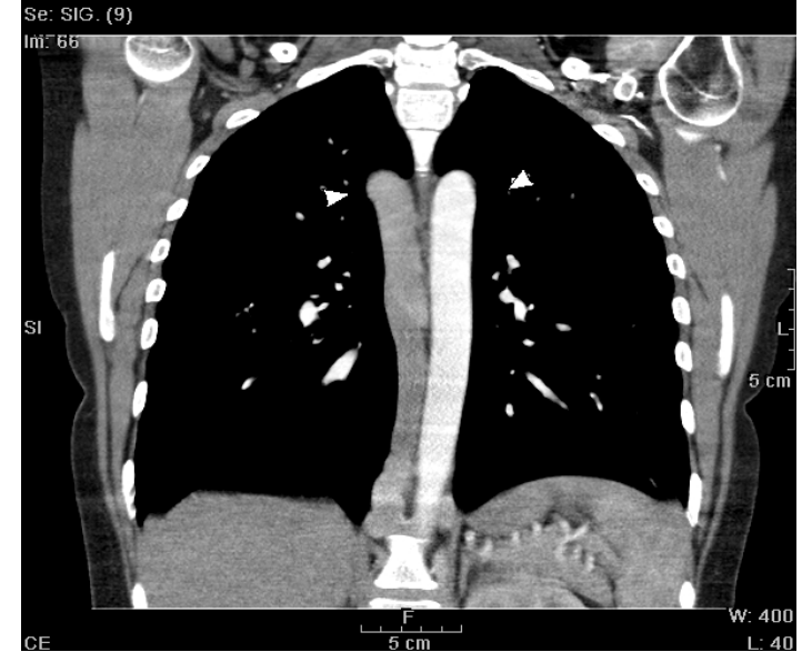
Fig. 4. This CT coronal slice of the chest shows the azygous vein (less contrast, horizontal arrow) and the descending aorta (left, with more density by arterial phase contrast, oblique arrow).

These three pairs of primitive veins appear in a chronological order between the fourth and eight weeks of gestation (Bass et al., 2000; Jiménez-Gil et al., 2006; Malaki et al., 2012). The posterior cardinal veins are the first to appear. These veins do not form any part of the definitive IVC, but their abnormal development may lead to a permanent morphological anomaly. By the seventh week of gestation, the right subcardinal vein forms the pre-renal/suprarrenal segment of the IVC. The supracardinal veins predominate by the eighth week and then differentiate into cranial (azygos) and caudal (lumbar) ends. The right supracardinal vein forms the infrarenal segment and the left supracardinal vein regresses (Malaki et al., 2012). The renal segment of the definitive IVC develops from the right supracardinal and subcardinal vein anastomoses. To summarize, the final adult form of the IVC is composed of four segments: the hepatic segment (derived from the vitelline vein); suprarenal segment (from the subcardinal-hepatic vein anastomosis); renal segment and infrarrenal segment which are formed as described above.