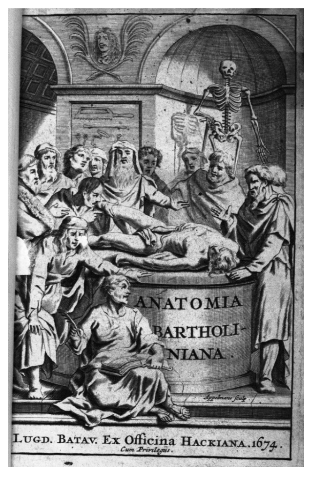
Fig 4. Image of the cover page from Bartholin's Institu tiones Anatomicae . This anatomical treatise was first published in 1641 and because of its popularity across Europe the text was published as multiple revised editions. The above image is from the fifth revised edition of the text which was published in 1674. Image in public domain.

Dissecti Historia, which was published in 1644 (Bartholin, 1662). Between 1654 and 1661, Bartholin published a collection of case histories of unusual anatomical and clinical structures, including descriptions and illustrations of anomalies and normal structures as the Historarium Anatomicarium Rariorum Centura, in six volumes (Bartholin, 2015). One such case description presented the clinical picture which was later classified as a congenital syndrome of multiple abnormalities produced by trisomy of chromosome number 13 by Klaus Patau in 1960 (Bartholin, 1654). Presently the condition is referred to as Bartholin-Patau syndrome. It was in Historarium that Bartholin first introduced the term 'Ossa wormiana' or 'wormian bones' after his uncle Ole Worm, who was first to make a detailed description of accessory or supernumerary bones present within the cranial sutures and fontanelle in a letter addressed to Bartholin (Ghosh et al., 2016). Bartholin also edited Acta Medica et Philosophica Hafniensa, one of the earli-